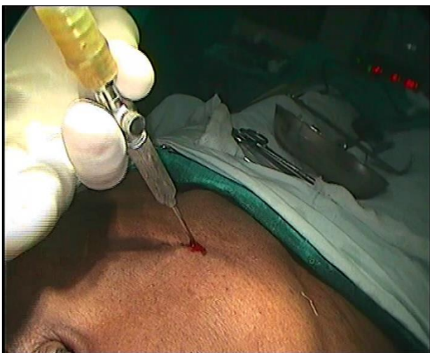
Figure 2: Veress needle in Dulucq method.

In all 50 patients, laparoscopic TEP repair done using balloon and non-balloon method for extra peritoneal space creation. Complication during operation time noted if it was observed. Total time of laparoscopic extra peritoneal space creation was noted in both group and total duration of operation was also noted (Figure 3).