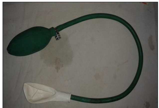
Figure 4: Handmade balloon device.

Patients were discharged once free of complications and once they resumed their activities of daily normal life. Patients were discharged within the next day or within 48 hours. At discharge, they were advised to come for stitch removal after 1 week, (1st follow up), and then after 2 weeks (2nd follow up), and then after 1 month of surgery, (3rd follow up).