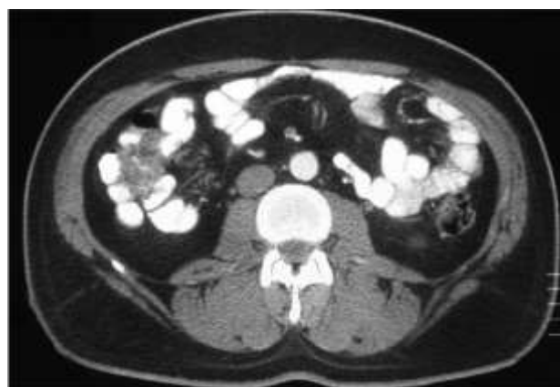
Figure 1: Axial contrast enhanced CT image shows displacement of small bowel loops by the well-defined fatty mass in the mesentery. Notice that the mesenteric vessels are not displaced but rather engulfed in the mass.

The radiological study, particularly CT and MRI, are essential components in the diagnostic evaluation, though many of its features are nonspecific. 5,6 The images vary according to the extent and the predominant component of the injury (inflammation, necrosis or fibrosis). 19,20