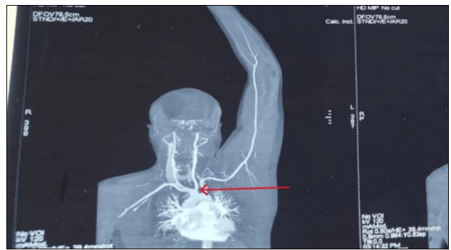
Figure 4: CT venogram showing bovine arch (red arrow).

The above film shows the common origin of left common carotid artery from innominate (brachiocephalic) artery, which is known as the Bovine Arch.