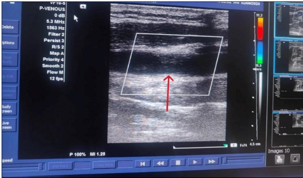
Figure 1: Ultrasound imaging showing thrombus in left internal jugular vein (red arrow).

which was seen compressing over left brachiocephalic vein (BCV). Also, left brachiocephalic vein appeared compressed between left CCA and medial head of left clavicle and manubrium sterni.