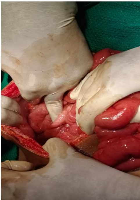
Figure 4: Intraoperative image showing transposition of the sigmoid colon to the right side, consistent with mirror-image anatomy in situs inversus totalis.