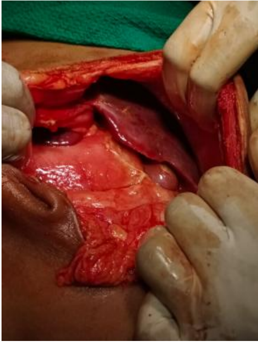
Figure 3: Intraoperative image showing mirror-image transposition of abdominal organs in situs inversus totalis. The liver and gallbladder are located on the left side, while the spleen is seen on the right. A gastric antral perforation is visualized near the lesser curvature, which is also positioned on the right side.

curvature (Figure 3). Remaining organs were found healthy.