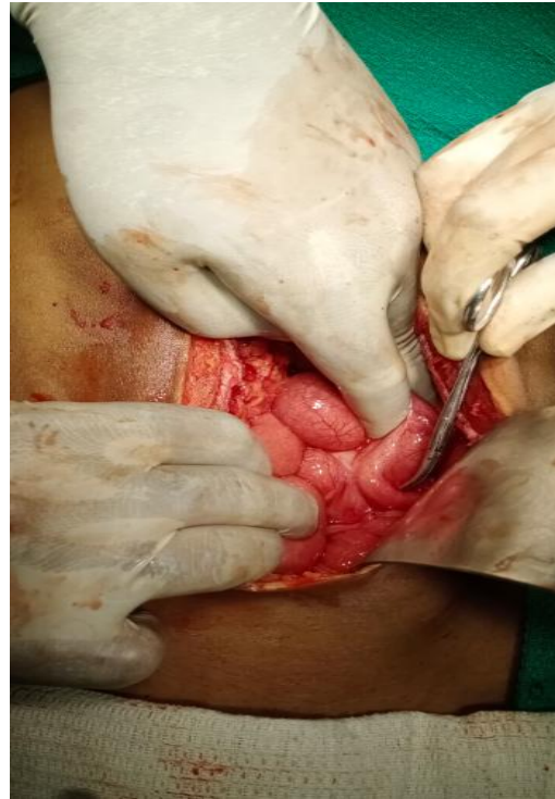
Figure 5: Intraoperative image showing the caecum with appendix located on the left side.

Surgical management was primary closure of the perforation with a live omental patch and thorough peritoneal lavage. No deviation from the surgical plan was required.