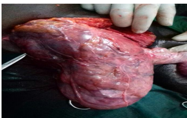
Figure 1: Huge hernia containing strangulated ileum.

Postoperative period was uneventful and patient was discharged home on the 7 th day of admission.