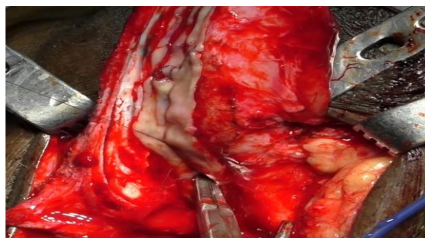
Figure 2: Ventral inlay.