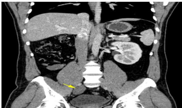
Figure 1: CECT image showing agenesis of right kidney. A well-defined round to oval shaped non-enhancing hypodense lesion noted in the pelvis, s/o seminal vesical cyst (yellow arrow).

vesical well-defined round to oval shaped hypodense cystic lesion with dilated tubular structures showing no contrast enhancement, s/o seminal vesical cyst with ejaculatory duct obstruction (Figure 1).