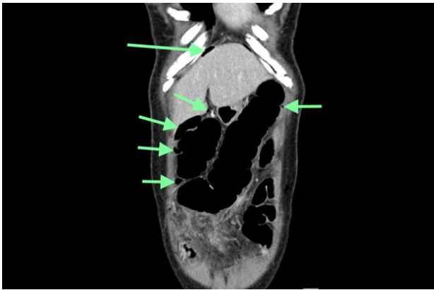
Figure 1: A contrast enhanced computed tomography scan of the abdomen and pelvis showing moderate volume pneumoperitoneum in the anterior and right upper quadrant (marked by the arrows).

A contrast-enhanced computed tomography (CT) scan in the early hours of day 10 of her admission (Figure 1) showed moderate pneumoperitoneum in the anterior abdomen and right upper quadrant without a clear site of perforation. A small collection was found in the region of the appendix (Figure 2) and a ruptured appendix was thought to be the source but there was also thickened bowel wall in the caecum and terminal ileum.