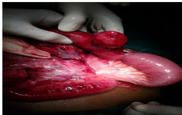
Figure 1: Congested meckel's diverticulum after removal from the hernial sac.

without difficulty. On physical examination a hard, tender lump was palpable in the right groin which was irreducible in nature. The leukocyte count was elevated i.e 13.7 \times 10^3/L with neutrophilia. Rest of the biochemical and hematological investigations were within normal limits. Plain abdominal radiograph demonstrated air fluid levels. But there was no evidence of intestinal obstruction. Diagnosis of an obstructed right inguinal hernia was made preoperatively.