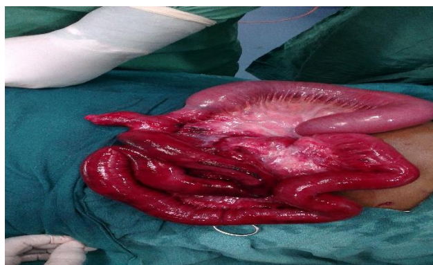
Figure 2: Congested Meckel's Diverticulum along with loops of ileum after removal from the hernial sac.

The pathology was approached through a right para-inguinal incision. An incarcerated inguinal hernia was found. The hernial contents were reddish, edematous with adhesions between the intestinal segments. The contents of the hernial sac were found to be a loop of ileum with an inflamed Meckel diverticulum at the base, 3.5cm long. The ileal loops proximal to the diverticulum was found to be dilated. The bands were dissected and the Meckel diverticulum was resected together with a segment of the small intestine and anastomosis made. Rest of the bowel was thoroughly examined for viability and was reduced into the abdomen. Bassini's herniorrhaphy was done with a prolene 1.0 suture. The patient did well without any complications and was discharged home on the seventh postoperative day.