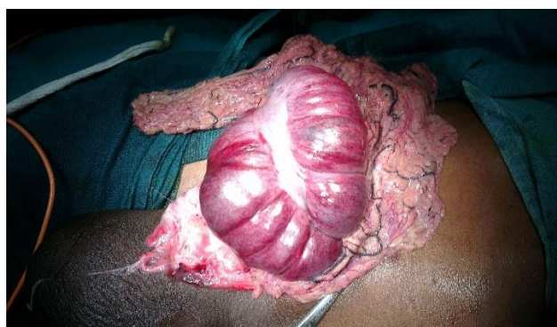
Figure 4: Opened up hernial sac.

On histopathological examination the Meckel's diverticulum was found to be lined by ileal mucosa and there was no ectopic tissue.