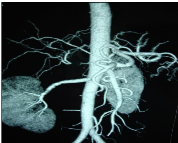
Figure 4: CT angiogram of right hepatic artery injury.

MRC revealed normal cholangiogram. These patients were managed successfully with conservative management. Percutaneous drainage of hepatic abscess was done in one patient. This patient developed external biliary fistula after the resolution of abscess and succumbed to sepsis, multi-organ failure after 1 month. One patient who had history of cholecystectomy 2 years back presented with abdominal pain evaluation with ultrasound revealed dilated CBD up to midpoint. Her liver function tests were normal except for the raised