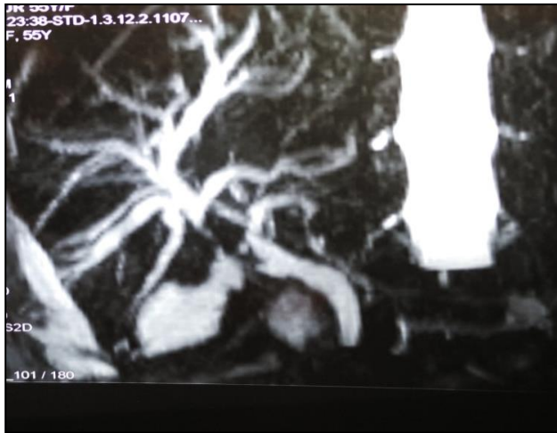
Figure 3: Right hepatic duct injury.

Two other patients had minor wound infection. Rest of the patients had uneventful outcome. One patient had type E 5 biliary stricture (Figure 2). Separate anastomosis of the right sectoral duct was done on same Roux loop. Conservative management was done in 4 patients. All these 4 patients presented with external biliary fistula after laparoscopic cholecystectomy.