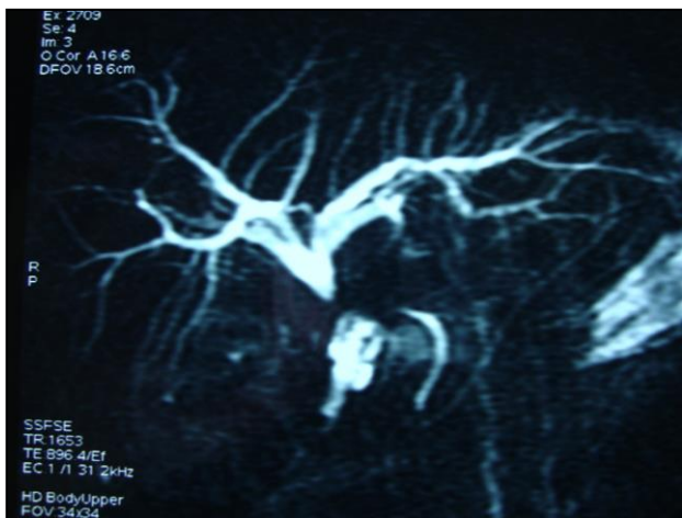
Figure 1: Type E2 biliary stricture.